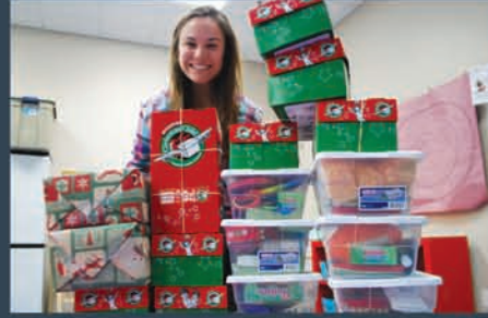
629 Operation Christmas Child shoe boxes donated (up 97 percent)