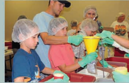
300 people spent a stormy Saturday packing meals for starving Haitians