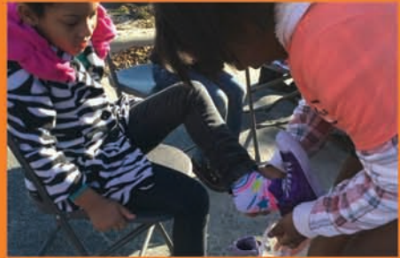
1,170 pairs of shoes distributed in youth Soles for Souls event (up 30 percent)