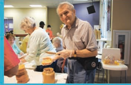
20,800 peanut butter & jelly sandwiches were made, which fed homeless people