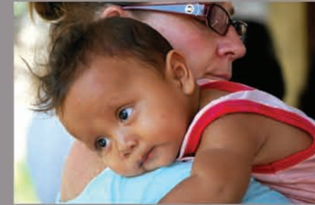
250 people served on mission trips all over the world – some multiple times